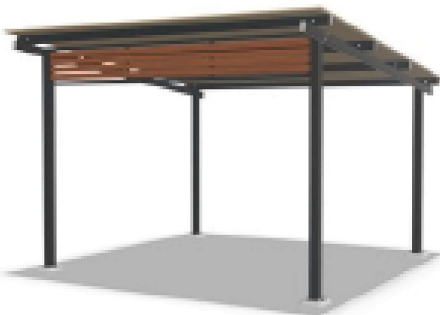
Typical picnic shelter