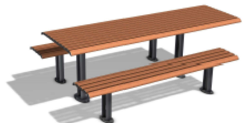
Typical picnic table