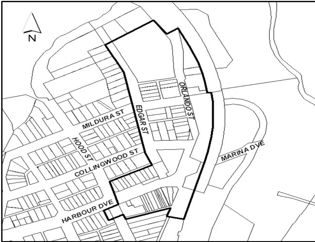
MAP 2 - Jetty Area Car Parking